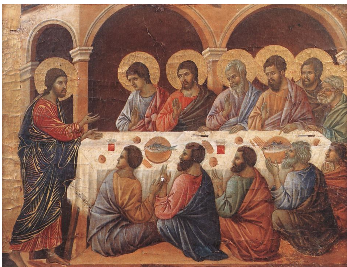
Duccio di Buoninsegna, Christ appears to the apostles at the table (1308–11), Museo dell'Opera del Duomo (Siena)

This week's texts if you want to reflect further: Acts 3: 13–15, 17–19; Psalm 4; 1 John 2: 1–5; Luke 24: 35–48